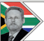
H.E Dr R. Davies Minister of Trade & Industry, South Africa