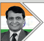
Mr Suresh Prabhu Minister of Commerce and Industry of the Republic of India