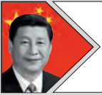
H.E President Xi Jinping Leader of the Peoples Republic of China