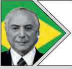
H.E Mr Temer President of the Federative Republic of Brazil