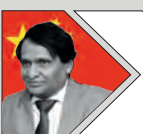
Mr Zhong Shan Minister of Commerce of the Peoples Republic of China