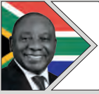
H.E Mr Cyril Ramaphosa President of the Republic of South Africa