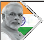
H.E Mr Narendra Modi Prime Minister of the Republic of India