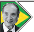
Mr Aloysio Nunes Ferreira Minister of External Relations of Brazil